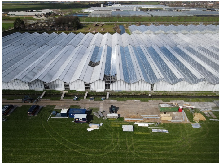
Roof Renovation of V.D.E. Greenhouse in Woubrugge, The Netherlands

The special Dripgard coating on the sheet helps to improve the yield of the Greenhouse by preventing condensation damages to the crops.